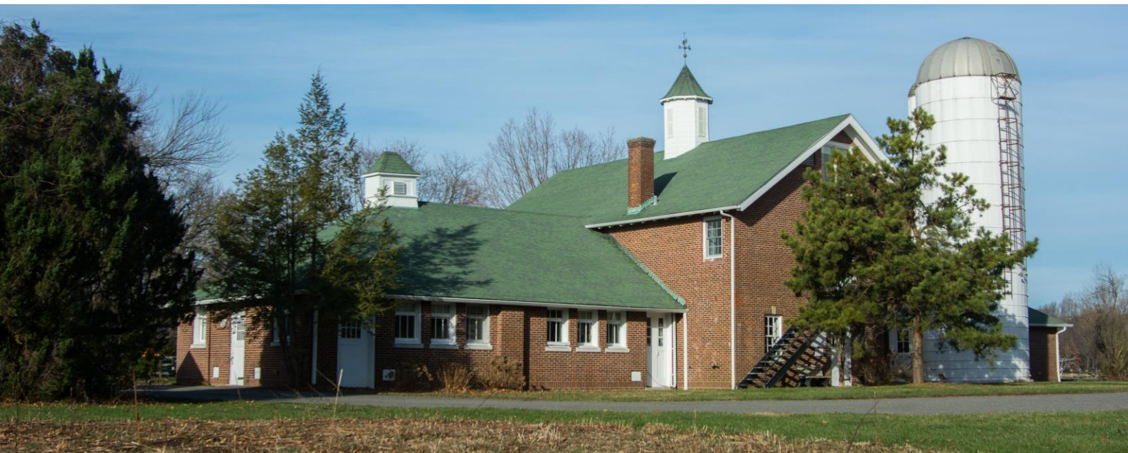
The barn at Uplands Farm Sanctuary, a former dairy farm donated to the Conservancy